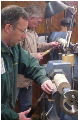
Students taking their first cuts with a skew

Having taught woodturning for the last 12 years, Gregory is also able to demonstrate or lecture for groups.